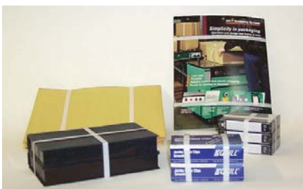
Low tension option for small packages